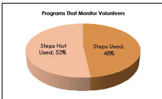
Figure 2a: Summary of number of steps used and not used by youth-serving programs in San Mateo County that consistently monitor volunteer mentors with youth.

Figures 1 and 2 indicate that programs not consistently monitoring volunteer mentors with youth use more steps than programs that do. While this is a good sign that programs recognize the importance of screening when choosing an unmonitored volunteer, this may be a risky bet for organizations who have no control over contact outside of the program. Screen as if your program's reputation depends upon it - because, ultimately, it does.